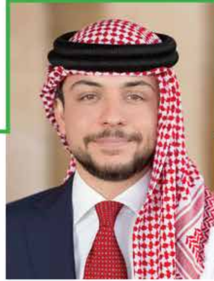
H.H. Crown Prince Hussein bin Abdullah II

”نحن لا نطلب من المجتمع أو المسؤولين أن يخلقوا لنا الفرص، ما نريده هو أن يوفرُوا البيئة التي تسمح للفرص أن تُخلق؛ بيئةٌ تستقبل الريادة بأيادٍ رحيمة، تحتضن الإبداع بلهفة، وتقدر المواهب. ما نحتاجه هو أن تُترك لنا المساحة لننطلق دون قيود أو محددات، التقاليد والمبادئ الأكثر استدامةً هي التي تتطور وتواكب تغيرات العصر. لذلك، علينا أن نعزز في شبابنا قيم التغيير والتجديد لا الانقياد والتبعية، الانفتاح لا الانغلاق، قيم حرية الاختيار والإبداع لا الاتكالية. هذا ما علمني إياه والدي، سيدنا“